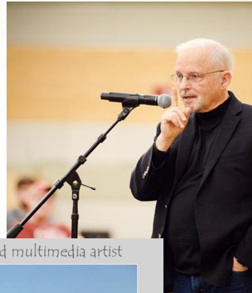
poet, writer, photographer, performance and multimedia artist